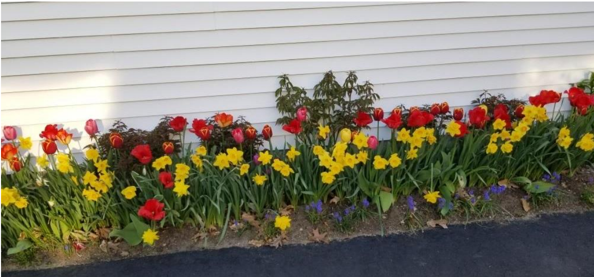
Spring comes to 86 Pine Street, Natick (and the deer leave the tulips alone, because they don't eat daffodils!)